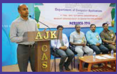
BCA NCRAICA 2016 28 JAN 2016 Dept of Computer Applications organizes A Two Day National Conference on Recent Advancements in Computer Application on 28 & 29<sup>th</sup> Jan 2016.