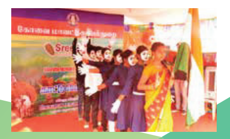
NSS PROGRAME The Coimbatore District Police and Students of AJK College of Arts and Science Celebrate Pongal Function with Local People of Chadivayal on 16<sup>th</sup> Jan 2017 at Covai Kuttralam.