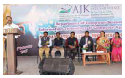
MINDSURF 2016 One Day National Level technical Symposium Conducted by Department of BCA,IT & CS on 24th Feb 2017.