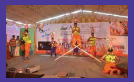
MIRACLE - 2K17 AJKCAS Conducts Inter-Collegiate Cultural fest on 16 & 17<sup>th</sup> Feb 2017.