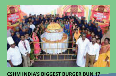
OCT 2016 The Department of Hotel Management and Catering Science students prepared India's Biggest Vegetable Burger Bun on 17<sup>th</sup> October 2016.