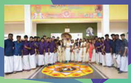
ONAM CELEBRATION 2016 ONAM Celebration 2016 at AJKCAS held on 09<sup>th</sup> September 2016.