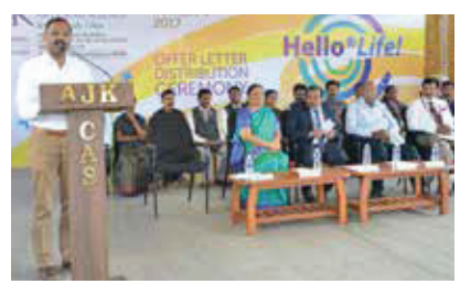
Hello Life 2017 AJK College conducted a Program to distribute Offer Letters to the Students who got placed in various Companies on 4<sup>th</sup> Mar 2017.