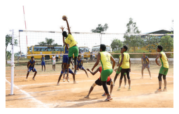
Volley Ball Trophy was conducted for school students on 29th Sep 2016