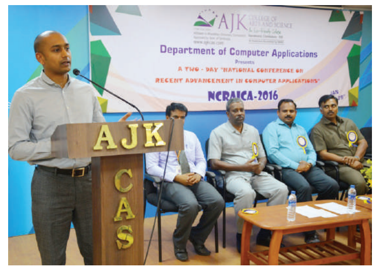
Department of Computer Applications organizes A Two Day National Conference on "Recent Advancements in Computer Application" on 28 & 29th Jun 2016.

A one-day seminar was conducted on the topic "New Trends in web technologies" on 20.01.2017. The resource person presented a clear view about web browsers and web applications. It helped the students learn quite a lot about web technologies.