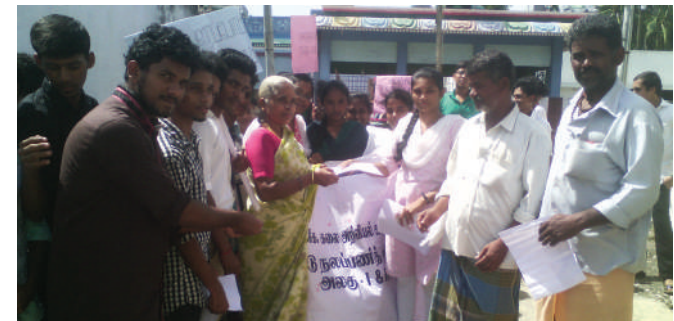
Swatch Bharat Awareness Rally done by NSS Volunteers at Pichanur Village on 19th Aug 2016