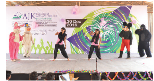
New Year 2017 was celebrated by our students on 30th Dec 2016