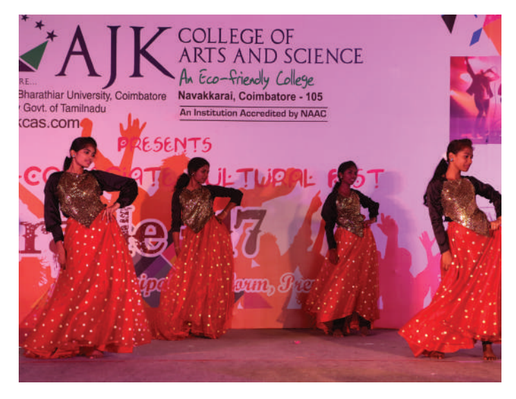
Intercollegiate Cultural Fest "Miracle 2017" was conducted on 16th and 17th Feb 2017