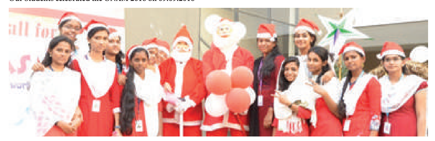
Christmas was celebrated by our students on 22 DEC 2016