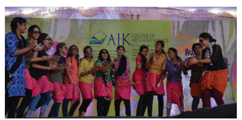
WOMANS DAY was celebrated by our students on 27 FEB 2016