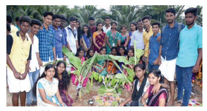
Pongal Celebration was held on 13th Jan 2017 . Students were participated in Various competition in traditional wears.